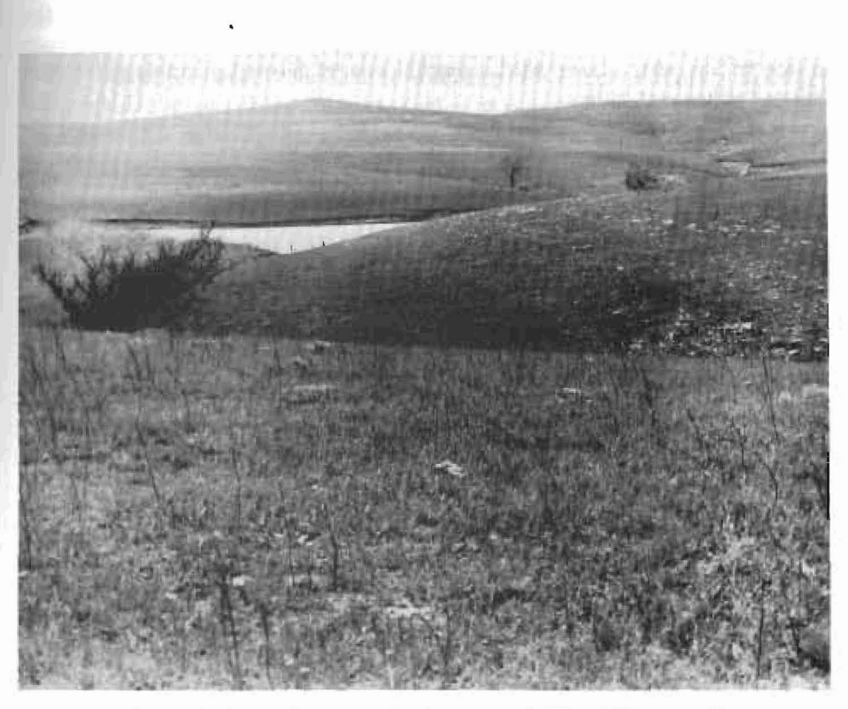
Recently burned pasture in the Central Flint Hills c. 1960

Burning in late spring improves the quality of plant carbohydrates in bluestem grass. The application of nitrogen to native pastures does not improve the nutrient content of forage but, with adequate rainfall, it does increase the amount of forage and thus the carrying capacity of the pastures.