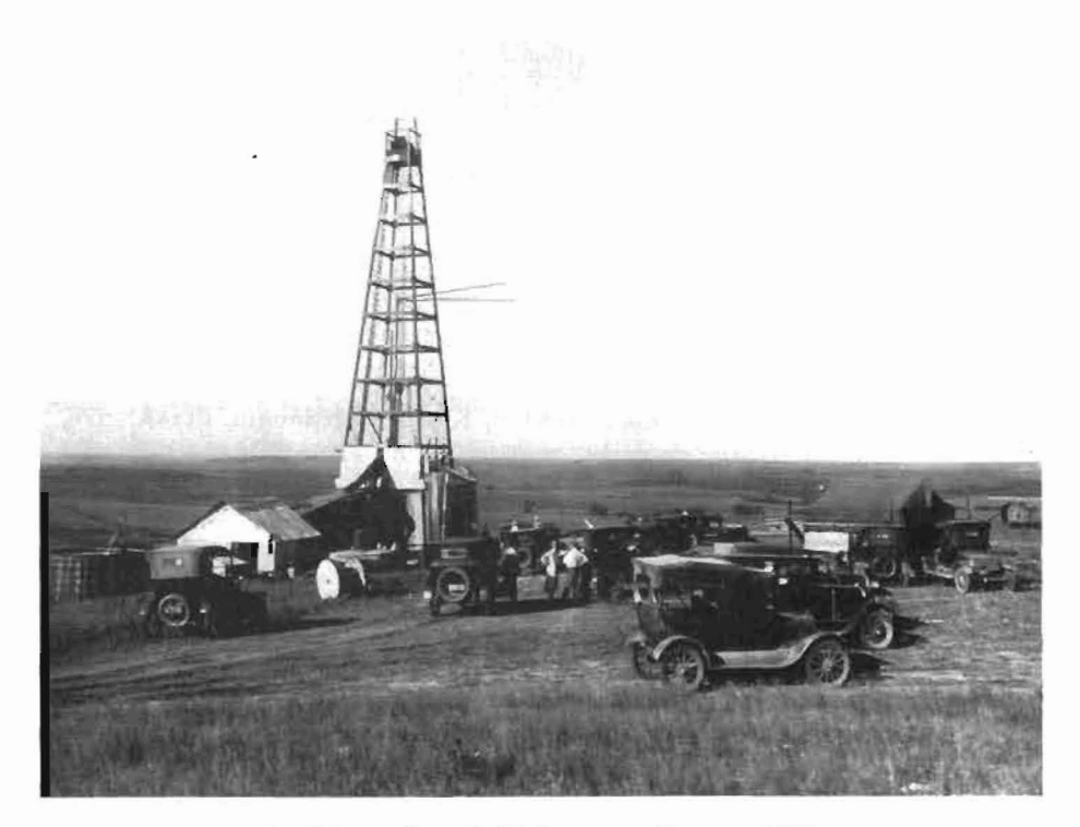
A wildcat oil well. Wabaunsee County, 1920s.