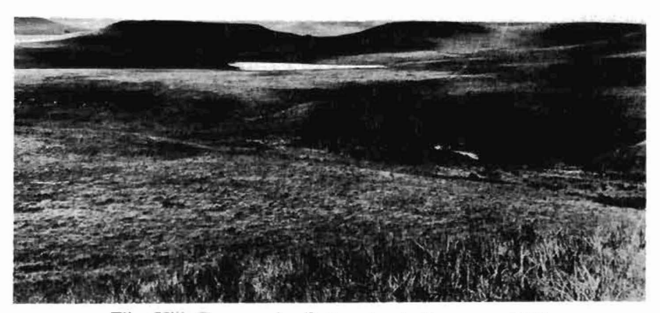
Flint Hills Topography. Pottawatomie County, c. 1958.

The Flint Hills of Kansas, along with the Osage Hills of Oklahoma, represent the last remaining enclave of unbroken native tallgrass prairie in the United States, a prairie that once stretched from Canada to Texas and extended east to Indiana and Kentucky. Grassland ecologists have noted that as much as eighty percent of a prairie lies below the surface. Not only are the underground root structures of the grasses extensive, but animal life teems in the thatch and in burrows. Perhaps that is why many people can drive through the Flint Hills and see nothing of significance or beauty--they are simply unable to look beyond the surface.