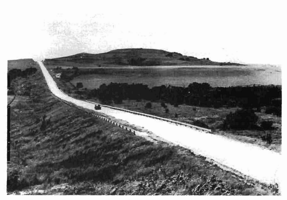
Buffalo Mound near Maple Hill. Wabaunsee County, late 1940s.

came and went, leaving behind the limestone that undergirds the Hills, the sides eventually eroding away into canyons and draws. It is, in fact, these limestone caprocks that formed the benches that give the Flint Hills their distinctive appearance. It might seem strange to an outsider to hear someone who lives on the western side of the Flint Hills upland speak of driving "down into the Hills," but the expression is not uncommon. Certain hills stand in evident relief amid their surroundings and have been named--Round Mound, Jacob's Mound, Osage Hill, Texaco Hill, and at least two Sugar Loaf hills--even though their overall altitude from sea level, 1500 to 1600 feet, is not particularly impressive.