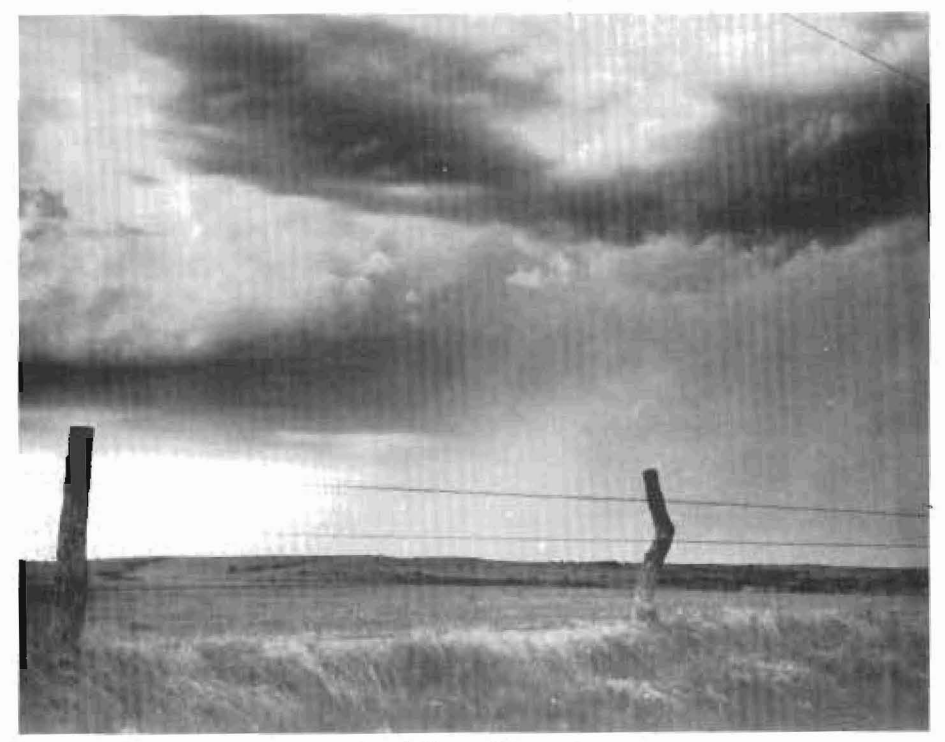
A typical Flint Hills landscape: grass, sky, and barbed wire. Wabaunsee County, c. 1960.

The articles in this section are nearly all technical in nature, reports of research performed by grass scientists or range management specialists. As might be expected, the Flint Hills, particularly since the establishment of the Konza Prairie Research Natural Area, comprise one of the world's leading laboratories for the study of grassland ecology.