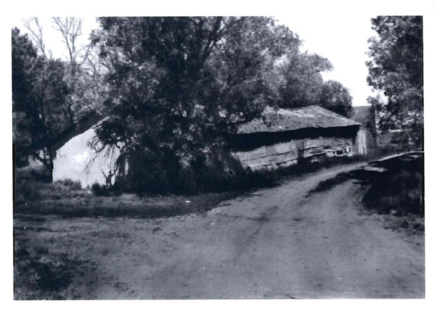
Hay-bale chicken house-two views