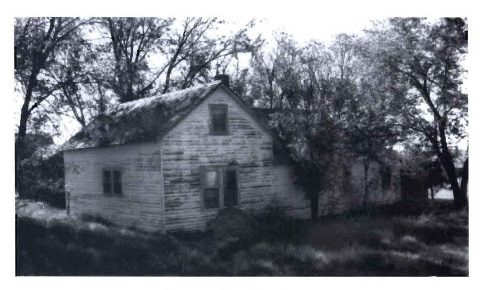
Two-story frame farm house

was moved to this site, judging by the foundation, no earlier than 1930. About the same time the owners built a cozy stucco bunkhouse nearby for the hired man. In addition there is another moved house that has been converted into a tack room, and a frame bunkhouse or residence for a family member is under halting construction. The owners of this farm either brought in residences from elsewhere to succeed their original ones, or they came from another place, took over this one, and moved their buildings with them.