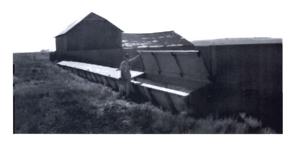
Feed bunks built into slope above feed lot

Furthermore, the emphasis on cattle culture prompted greater emphasis on saddle horses and thus construction of a horse barn and corral complex.