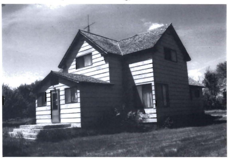
Deutscher farm house

The Deutscher farm is situated in the rolling wheat country of northeast Bowman County.<sup>6</sup> This place would have been settled in about 1907, although no trace of a farmhouse dating from that time remains. The cross-gabled main residence on the place dates from the 1910s, but judging by the more recent foundation, was moved here from some other location, perhaps in the 1920s, and has been renovated since the 1960s. It is puzzling that the farmhouse is currently unoccupied; this indicates some discontinuity in succession.