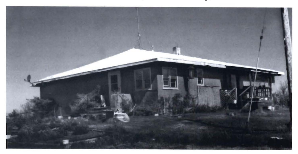
Grand River farm house

The Grand River Farm and Ranch is located on a bench just north of the Grand River in the southeast corner of Bowman County. This is a mixed landscape, with the river bottom and the rough hills on its north side used for grazing, but with nearby, rolling uplands used for grain farming. The Grand River Farm and Ranch complex comprises twenty-eight buildings, evidence that its material culture was swelled by additions from surrounding operations that were abandoned.