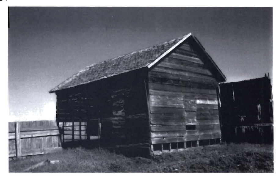
Homestead shanty converted to hoghouse