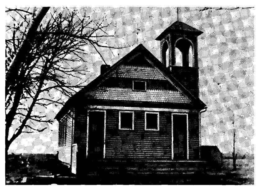
Old frame country school house with water pump in front and belfry on top. Douglas County, early 1900's probably.

keep numberless boys and girls of all sizes and ages alert and running from one side of the schoolhouse to the other in a lively game of Ante-Over, as the ball was thrown over the roof to be caught by rival players on the opposite side. (The littlest folks could have a game of their own over the smaller coalhouse roof.) Baseball was even then a nationally favored game, but lacking