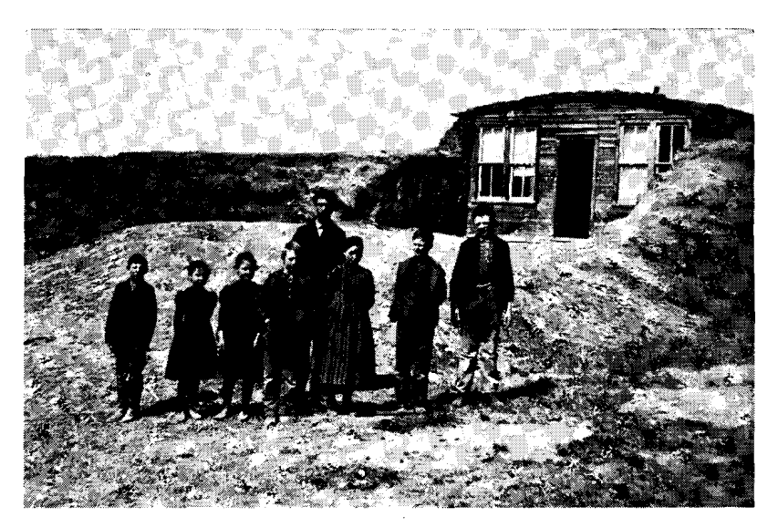
Dugout school, Thomas County, about 1900.

So the days that were merge into the days that are and constitute a prized heritage.