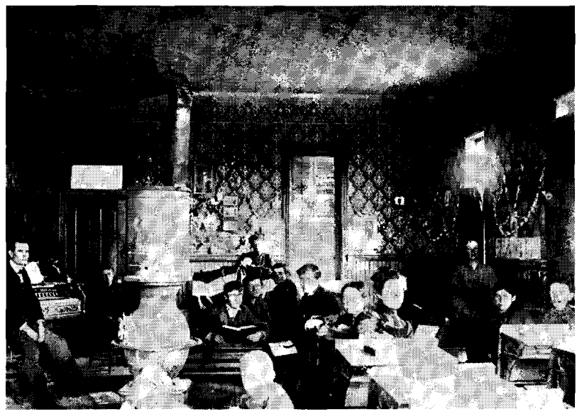
Interior of a school near Leoti, Wichita County, in the 1890's. Note especially the age of the pupils, the old stove and pump organ, and the wallpaper.

On the wall in the rear of the room behind the inner doors were shelves for the dinner pails, and hooks for the children's coats and caps. The dinner pails were mostly tin syrup buckets, half-gallon or gallon size. Every family was sure to have several